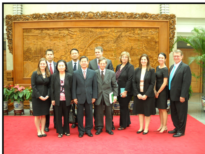
2010 Policymakers delegation inside the Chinese Ministry of Foreign Affairs in Beijing, China.

Through their informative tour of the country, participants were able to gain deeper insight into Chinese society and China's alternative energy development efforts. It is USCPF's hope that the Policymakers program will help congressional staff members apply a more thorough understanding of China to their work advising members of Congress.