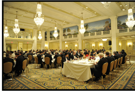
The USCPF 2010 Annual Gala Dinner was held on November 15, 2010, at the Willard InterContinental hotel in Washington, D.C.