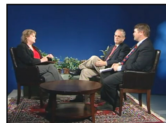
China Forum discussion with RAND analysts.