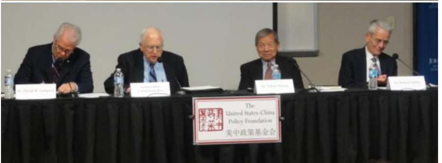
Top: 2017 Policymakers Congressional Staff Delegation at the Ministry of Foreign Affairs; Center: 2015 Ageless Chinese Art Exhibition at George Mason University; Bottom: 2017 Panel on China's 19th Party Congress